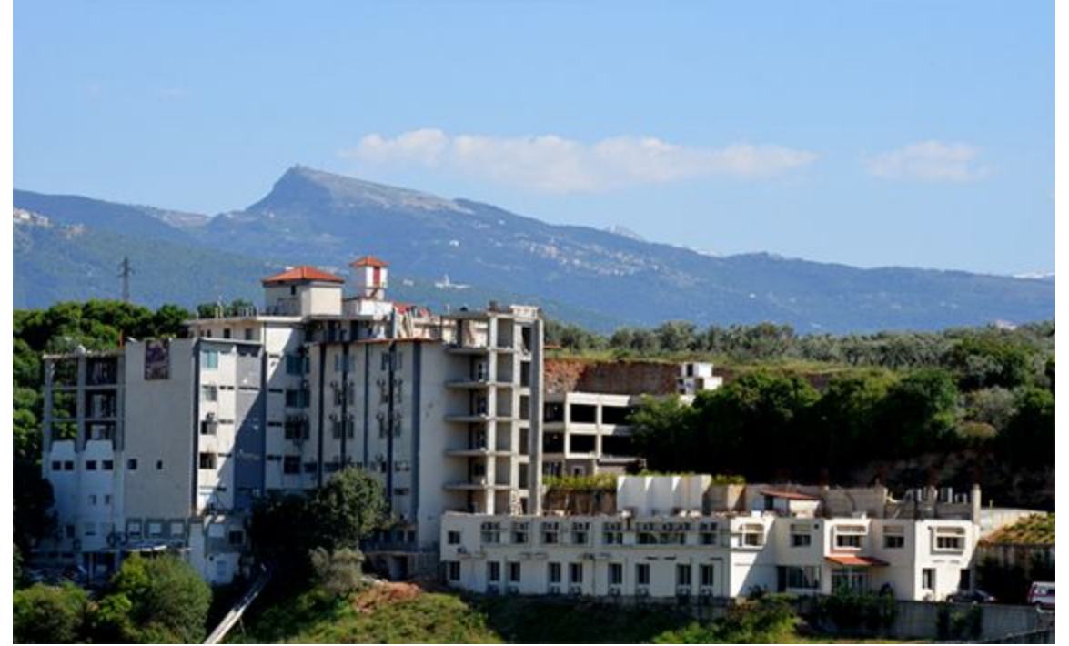
Tripoli Public hospital - Saydet Zgharta University Medical Center